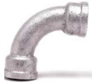
GBF – FEMALE BEND