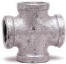
GCR – CROSS