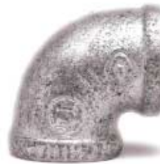
GE – FEMALE ELBOW