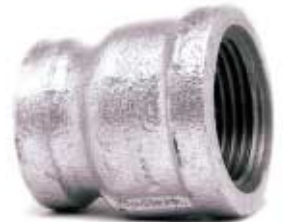
GRS – REDUCING SOCKET