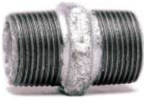
GN – HEX NIPPLE