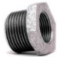
GRB – REDUCING BUSH