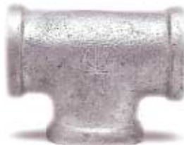
GT – TEE