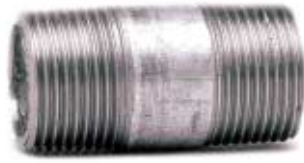
GBN – BARREL NIPPLE