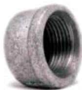
GC – CAP