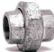
GU – UNIONS