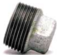
GP – PLUG