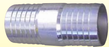
HM – GALVANISED HOSE MENDER Sizes from 1/2" to 8"