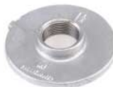
GF – FLANGES

All BSP threads. Also available in black weldable.