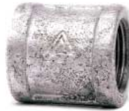
GS – SOCKET