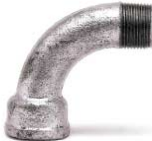
GBMF – M &amp; F BEND