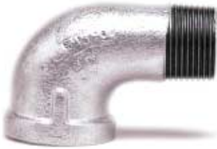
GEMF – M &amp; F ELBOW