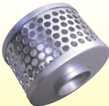
GSTR – GALVANISED SUCTION STRAINER Sizes from 1" to 8"

All BSP threads. Also available in black weldable.