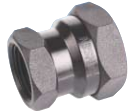
HSRS – REDUCING SOCKET