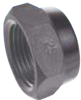
HCP – CAP