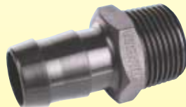
HTT – PLAIN MALE TAIL

ITEMS MARKED * ARE AVAILABLE IN A REDUCING OPTION