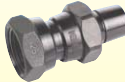
HFS – FEMALE TAILS*