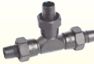
HT – TEES*