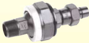
KU – KNUCKLE UNION