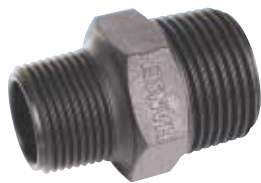
HRHN – REDUCING NIPPLE