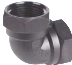
HTE – FEMALE ELBOW