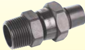
HMS – MALE TAILS*