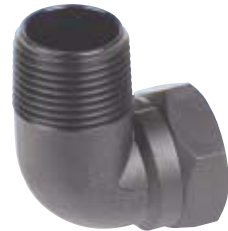
HTMFE – MALE FEMALE ELBOW