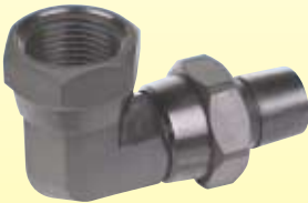
HFB – FEMALE BENDS*