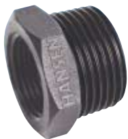
HRB – REDUCING BUSH