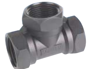
HTT – TEE