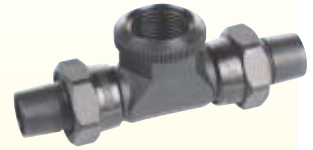
HFT – THREADED TEES