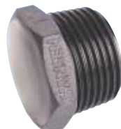
HSP – PLUG