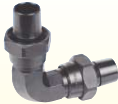
HB – BENDS