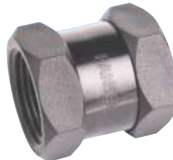
HS – SOCKET