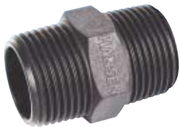
HN – NIPPLE