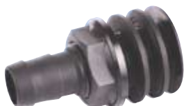
HTF – TANK FITTING