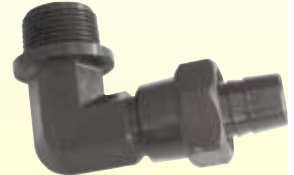
HMB – MALE BENDS*