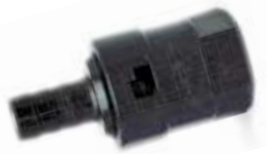
HQC – QUICK RELEASE COUPLING